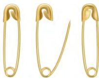
Gold Safety Pin Size Approx 18mm x 5mm